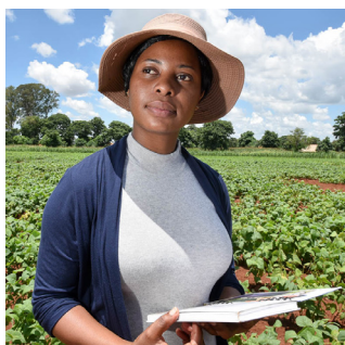
Trials of drought tolerant beans in Malawi, which is suffering from its worst drought in three decades N. Palmer CIAT. Photo: Courtesy of CGIAR System Organization