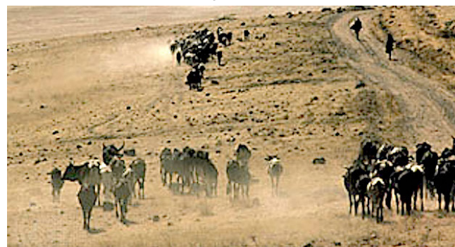
Herders migrating with livestock.

There is increasing poverty levels in drylands of Sub-Saharan Africa where 41% of the total population live in extreme poverty. For eastern Africa, both recent droughts and decadal declines have been linked to human-induced warming. There is high confidence that many oases of North Africa are